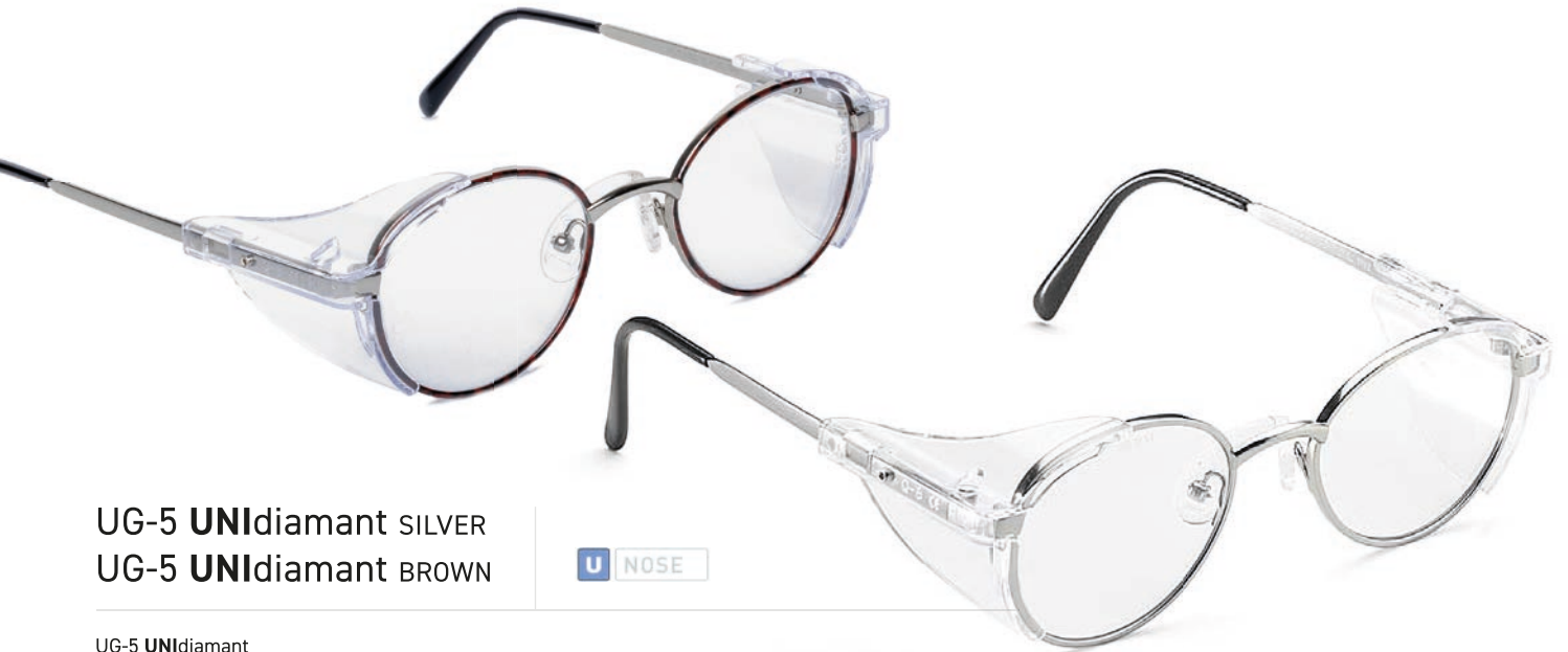
UG-5 UNIdiamant SILVER UG-5 UNIdiamant BROWN