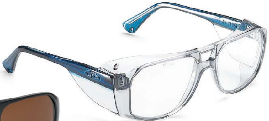
UG-9 Horizon SMOKE BLUE

Art.No. 3793 0051 00 | UG-9 Horizon Sun-Clip S UV400