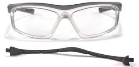
Art.No. 9982 2182 00 UG-20 Soft-Stirnpolster UG-20 Soft-Brow pad